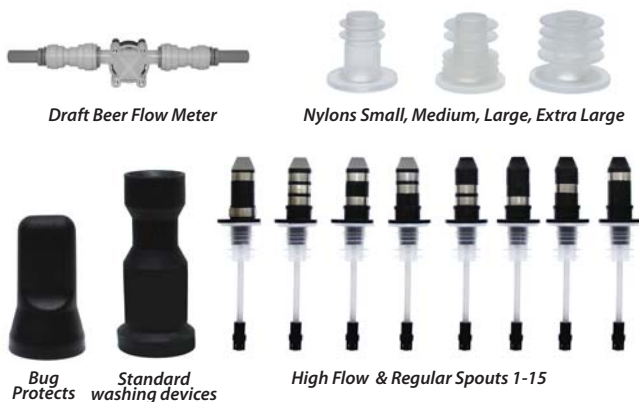
Draft Beer Flow Meter