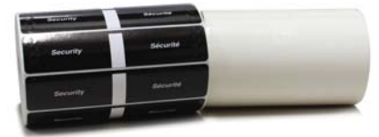
Regular Security Seals