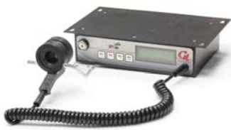
Robust Casing Flush front face