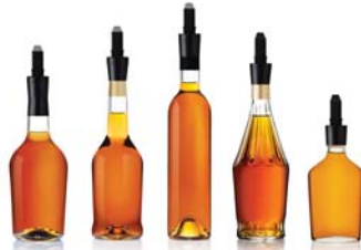
Secure All your Inventory