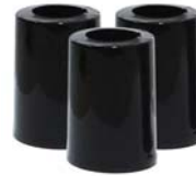
Heat Shrink Security Seals